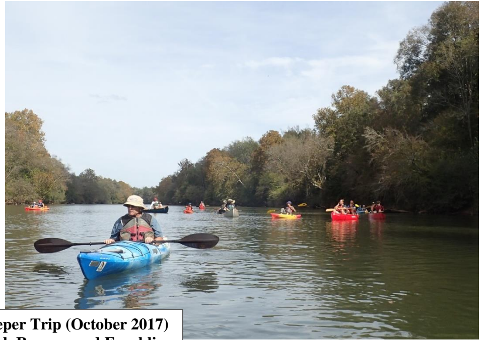
Chattahoochee Riverkeeper Trip (October 2017) Taken between McIntosh Reserve and Franklin