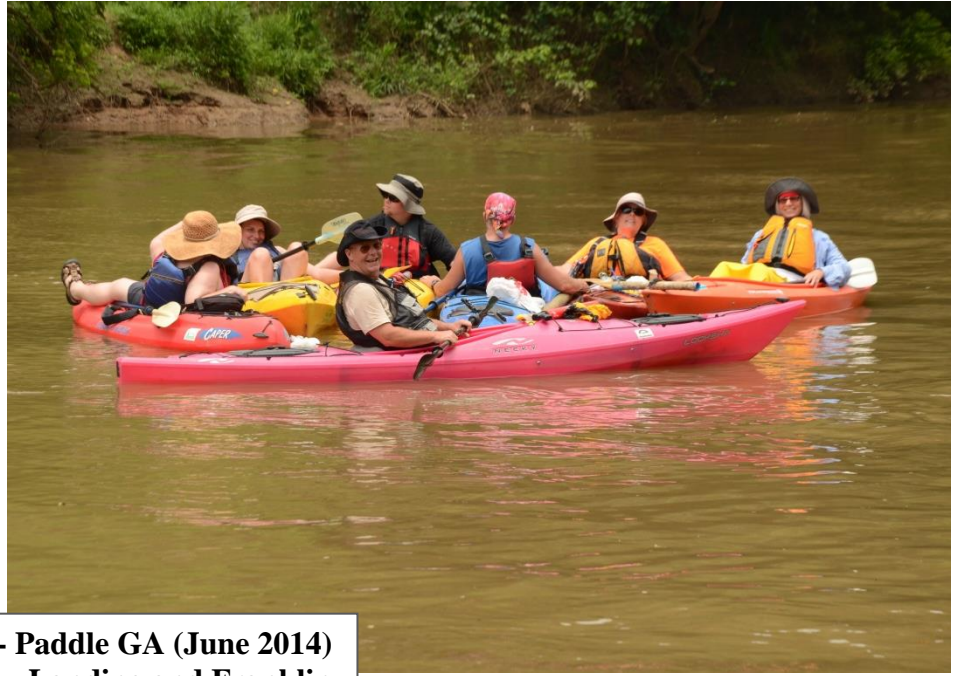
Georgia River Network - Paddle GA (June 2014) Taken between Riverview Landing and Franklin