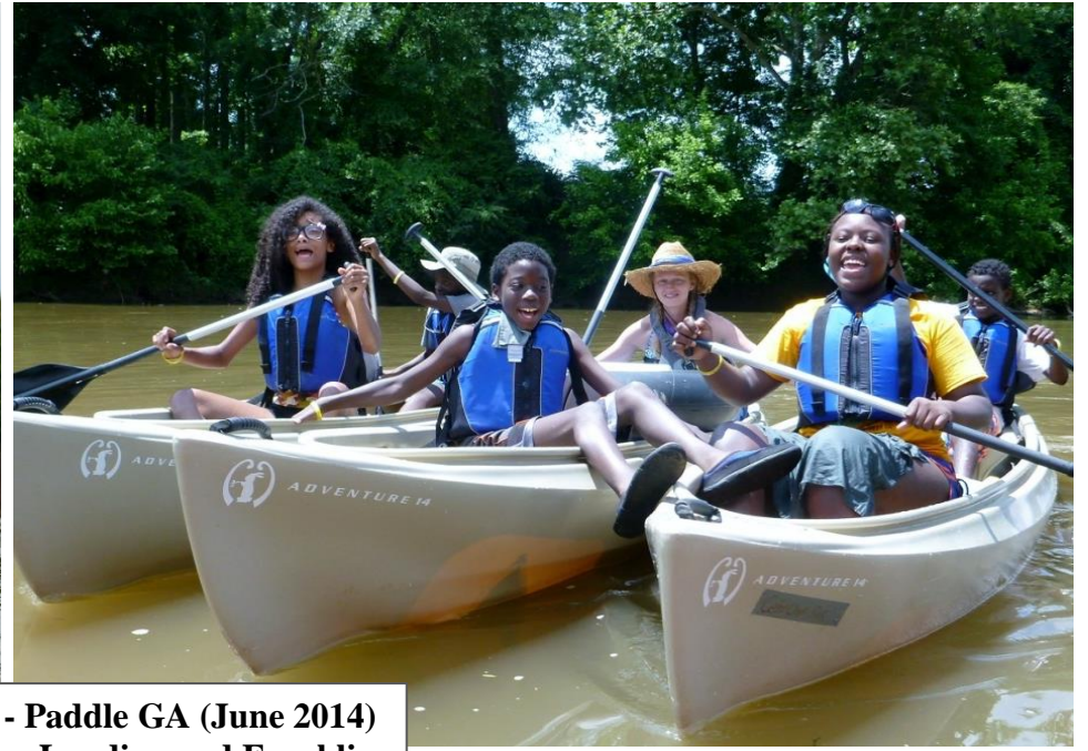
Georgia River Network - Paddle GA (June 2014) Taken between Riverview Landing and Franklin