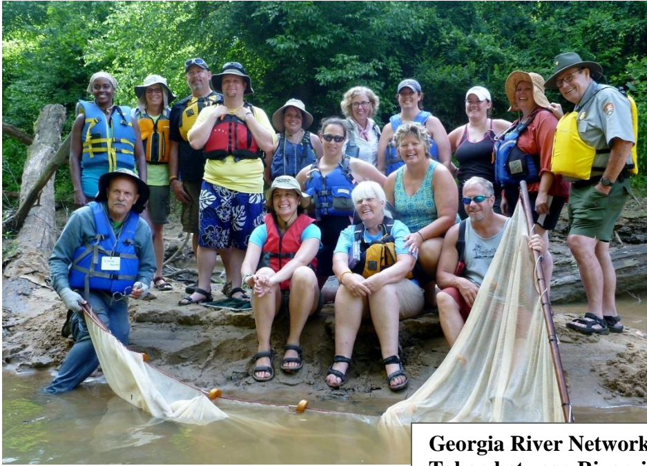
Exhibit C – Photographs of River Users Recreating on the Chattahoochee River between Peachtree Creek and New River