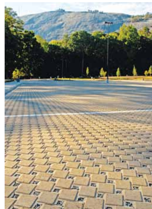
The parking lot at Stone Mountain Park is a highly successful example of pervious paving.