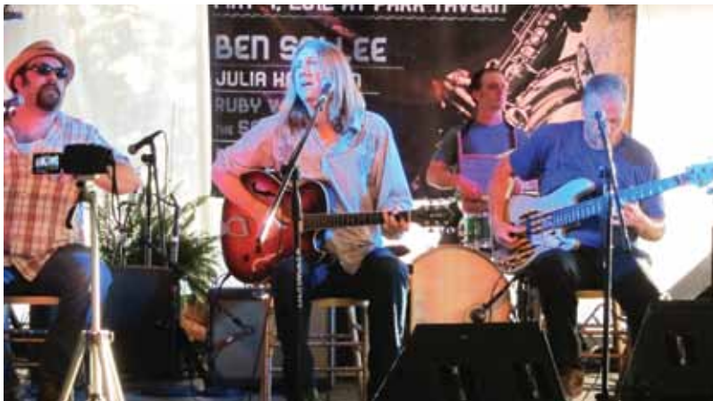
Atlanta’s Burnt Bacon opened the evening with a bluesy set.

Feedback on the event, based on our first-ever online survey, was overwhelmingly positive and also instructive. Some of the most interesting statistics and comments: