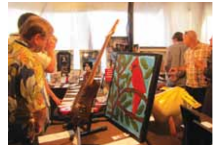
Guests review the silent auction offerings.