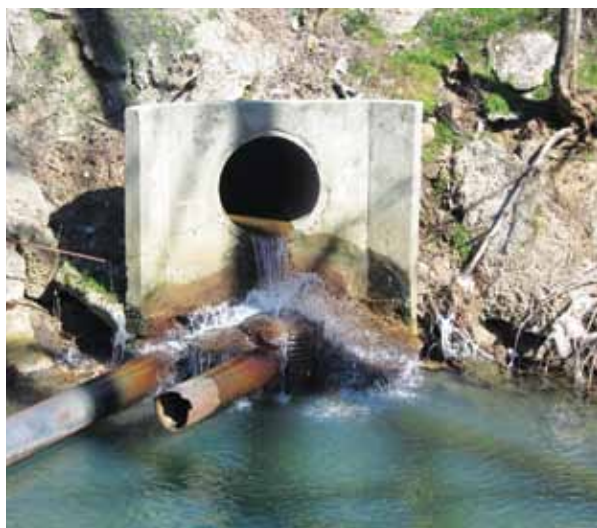
Treated drinking water flowed from a storm drain under Ansley Mall into Clear Creek; this leak was stopped in May.

To report a leak in the city of Atlanta, see www.atlantawatershed.org/emergency or call 404-658-6500.