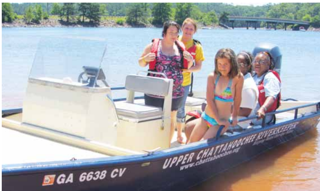
Festival participants enjoy a ride around the lake on CRK’s patrol boat.