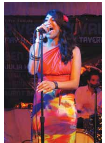
Ruby Velle & the Soulphonics closed out the night with a rousing, R&B revue-fueled set.