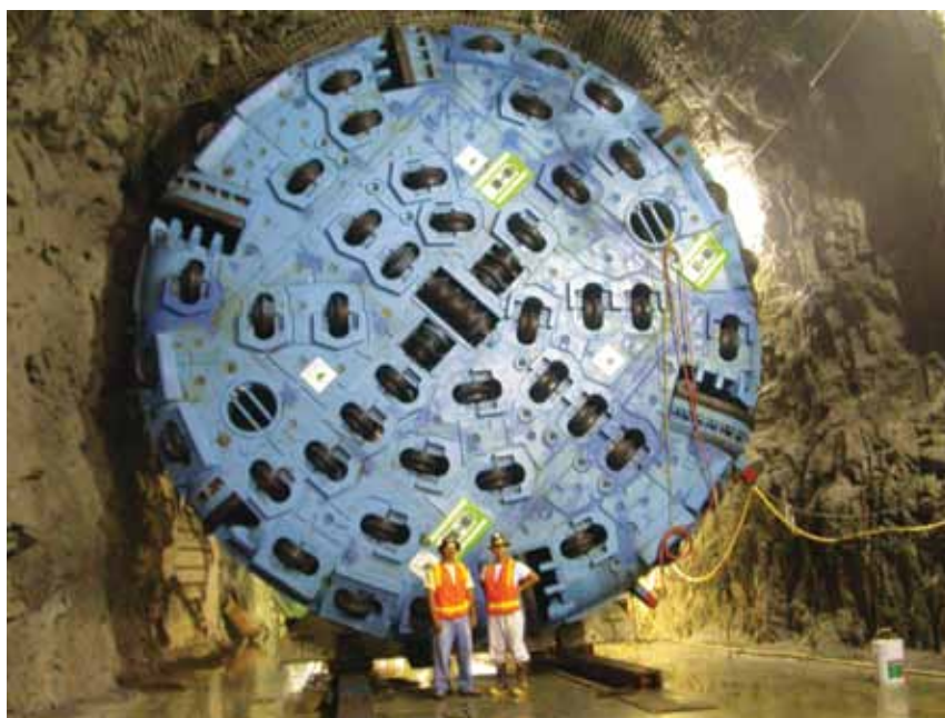
City workers stand in front of the massive boring machine used to cut through granite under Atlanta and create storage for sewage and polluted stormwater prior to treatment.

As hard as it is to believe, environmental officials at all levels knew about the situation that threatened public health, recreation areas and property values, but they did nothing — even though Atlanta's pollution was