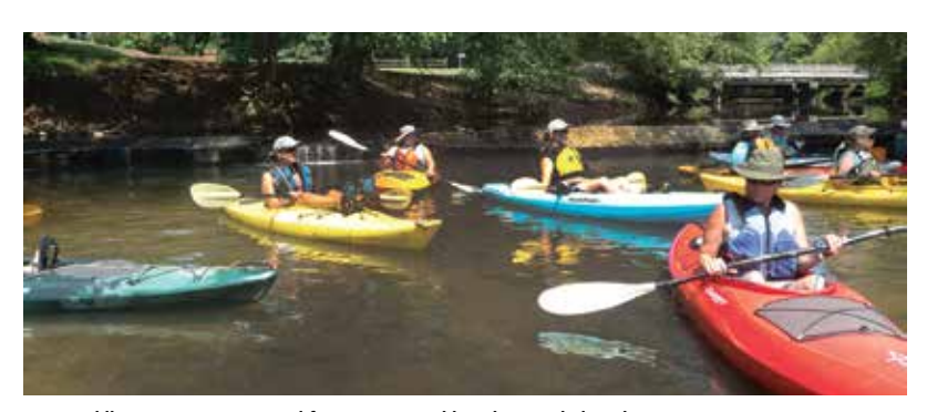
Nine paddles trips were organized for canoeists and kayakers, including the River Discovery Series.

Twitter: @CRKeeper • Facebook: Chattahoochee Riverkeeper