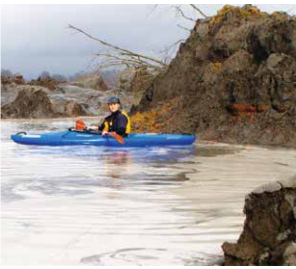
after the massive coal ash spill in 2008.

CRK participated in the EPA rulemaking process by submitting written comments calling for protective, nationally uniform standards. We continue to advocate for comprehensive regulation of coal ash storage, including monitoring requirements and proper closure for retired lagoons.