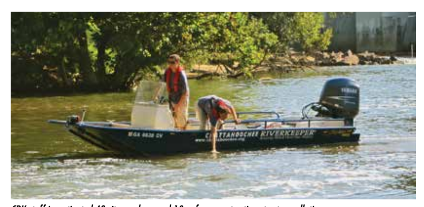
CRK staff investigated 49 sites and secured 10 enforcement actions to stop pollution.

hattahoochee Riverkeeper enjoyed a tremendous year of accomplishments in protecting and restoring the river that supplies ✓ drinking water, recreation and more for nearly 4 million Georgians. Here's a look at our 2012 metrics — check out the complete list at www.chattahoochee.org/accomplishments/php.